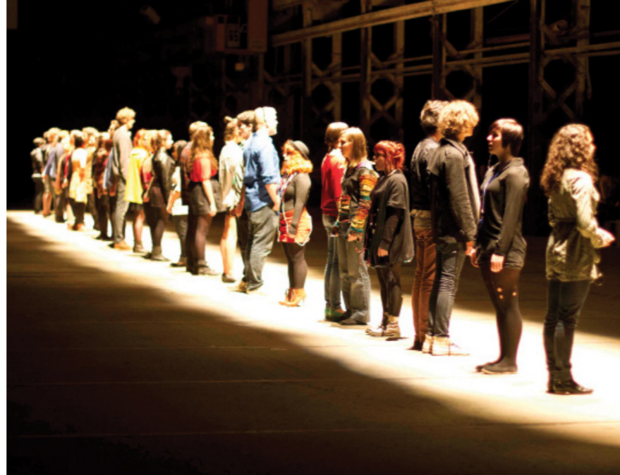
The Totally Huge New Music Festival